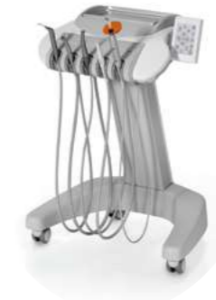
Astral Lux Model