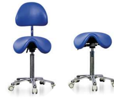
Pony Model with backrest